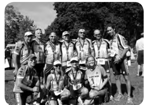
Team Will triathletes after a Westchester Triathlon race