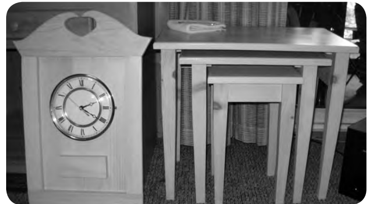
Wonderful wooden raffle prizes