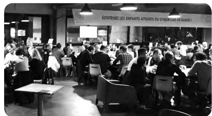
4 th Barth France Poker Tournament in Paris