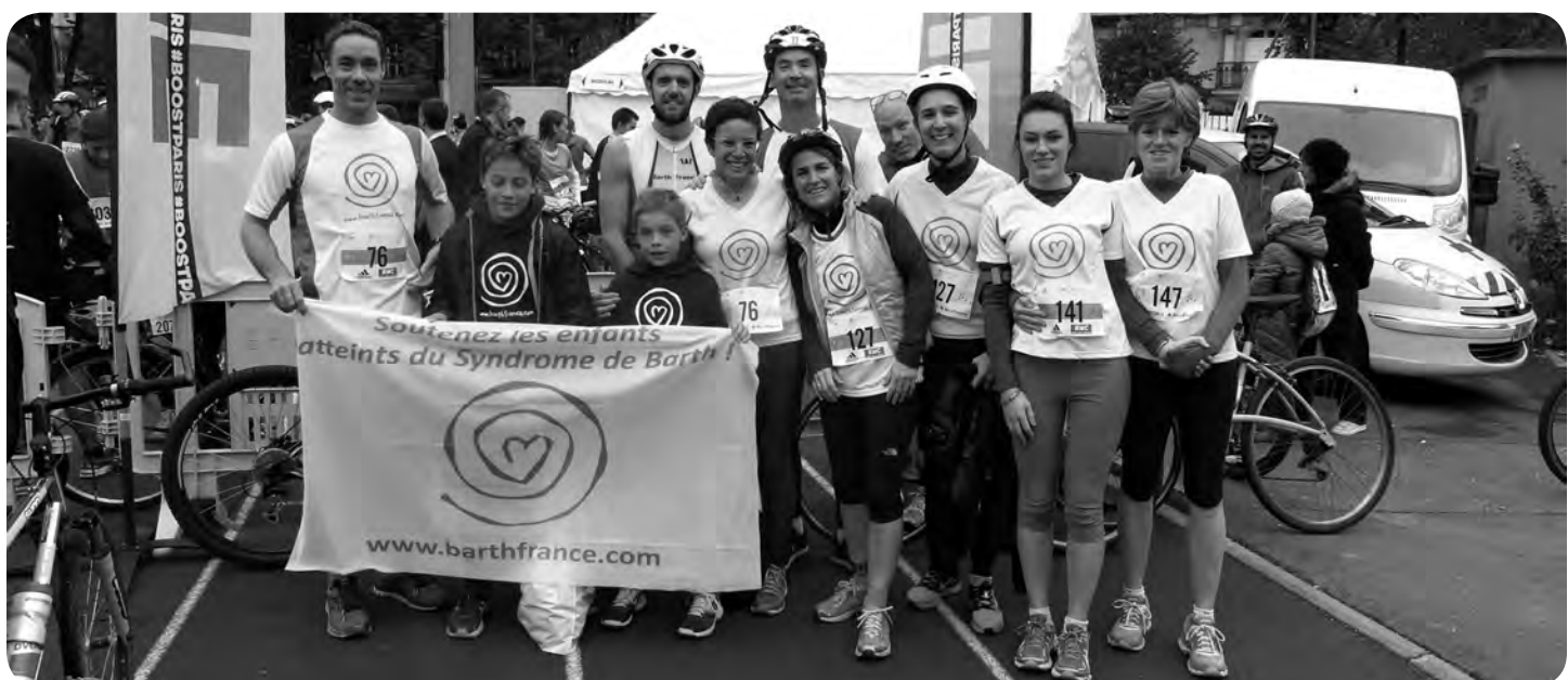
Team Barth France at the Paris Bike and Run