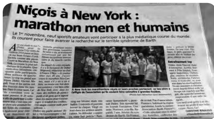
Barth syndrome hits the news