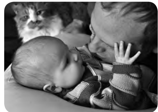
Rhys & Sandt 2011