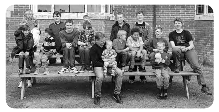
Barth boys enjoying a chance to sit down during a busy Activity Weekend