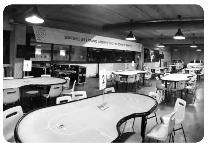
Setting up for the Barth Poker Tournament (Cont'd on page 26) Barth Syndrome Journal ~ Volume 17, Issue 2 Page 25

As this was meant to be one of our "Big Barth Weekends," at the same time, a fireman friend of ours and team member of