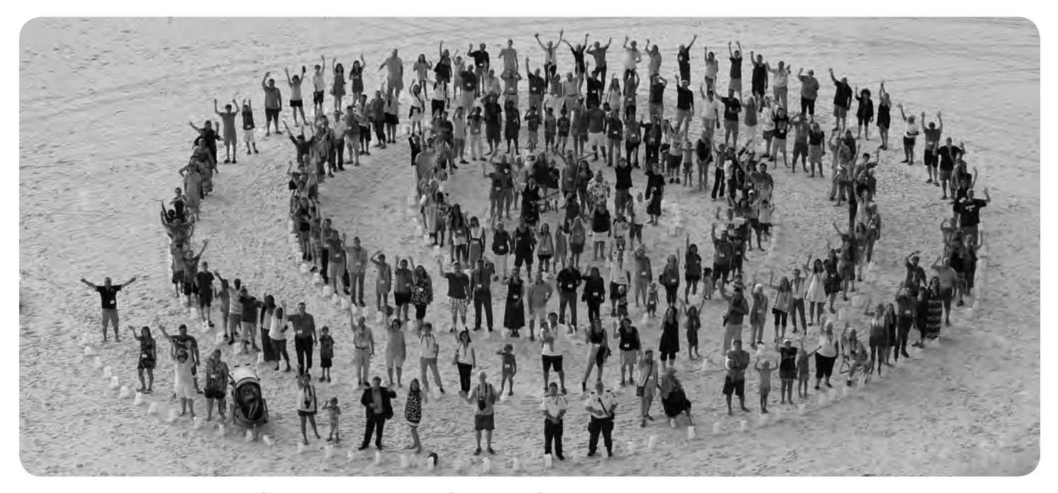
Conference attendees at BSF's 2016 conference

As the 2018 BSF conference approaches, why not come and share in the knowledge, experiences, and love that this unique community possesses.