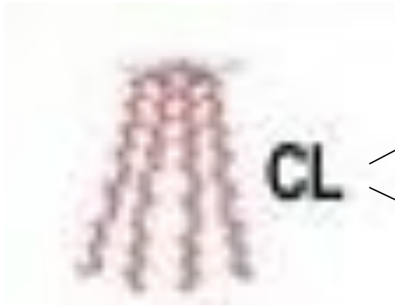
Inner mitochondrial membrane (IMM) of functional mitochondria

High ATP (energy) Low ROS (oxidative stress)